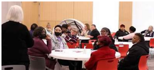
Graduates, leaders, guests and mentors watched and discussed the War Room movie.