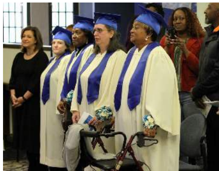
Right: Participants listen as they wait for their names to be called at graduation.