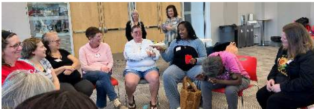
The Cup and Spoon game provided lots of laughter.

The last game was Telestrations , another box game that requires drawing and understanding. We repeated our main verse as we learned from the game that there can sometimes be misunderstandings in communication, but the love of the Lord will again fill our mouths with laughter and shouts of joy.